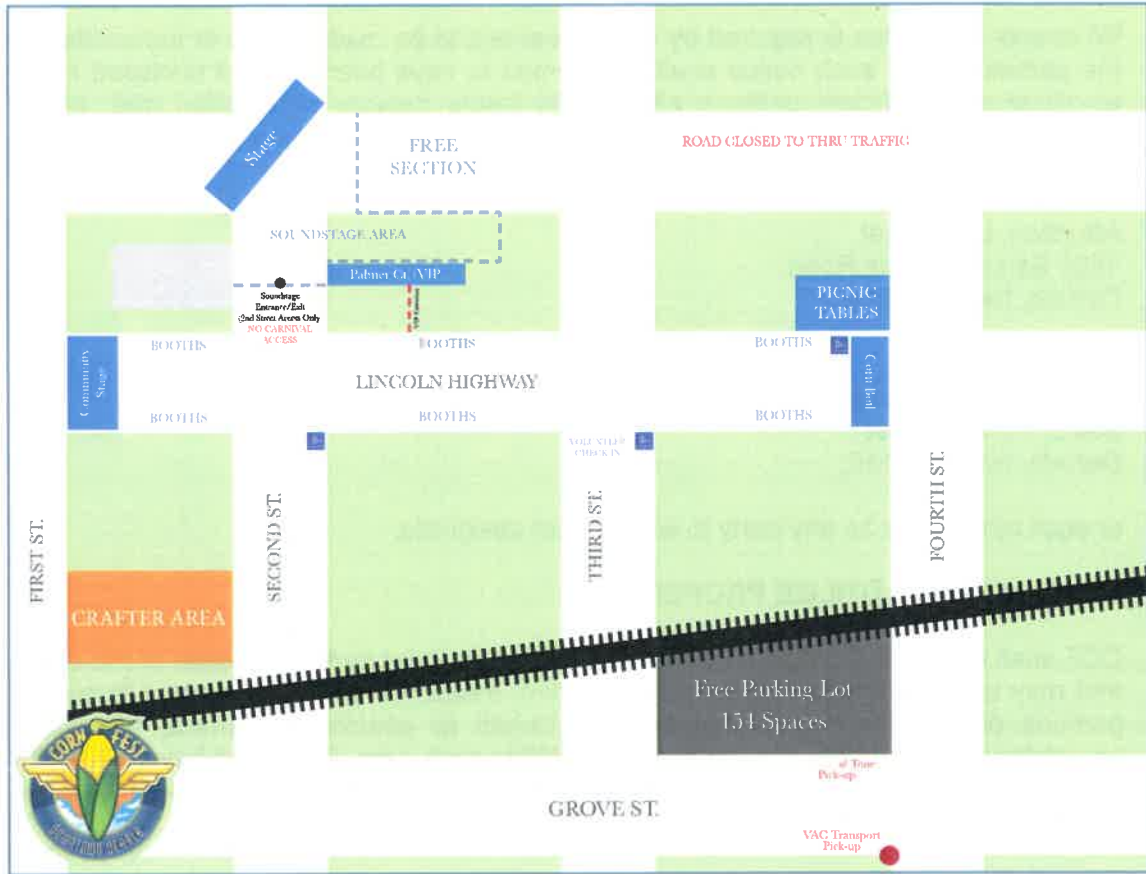
EXHIBIT A 2019 SITE PLAN