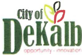
Exhibit J: Form of Bid Addendum

200 South Fourth Street DeKalb, Illinois 60115 815.748.2000 • cityofdekalb.com